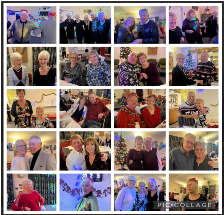
Christmas Party 2025